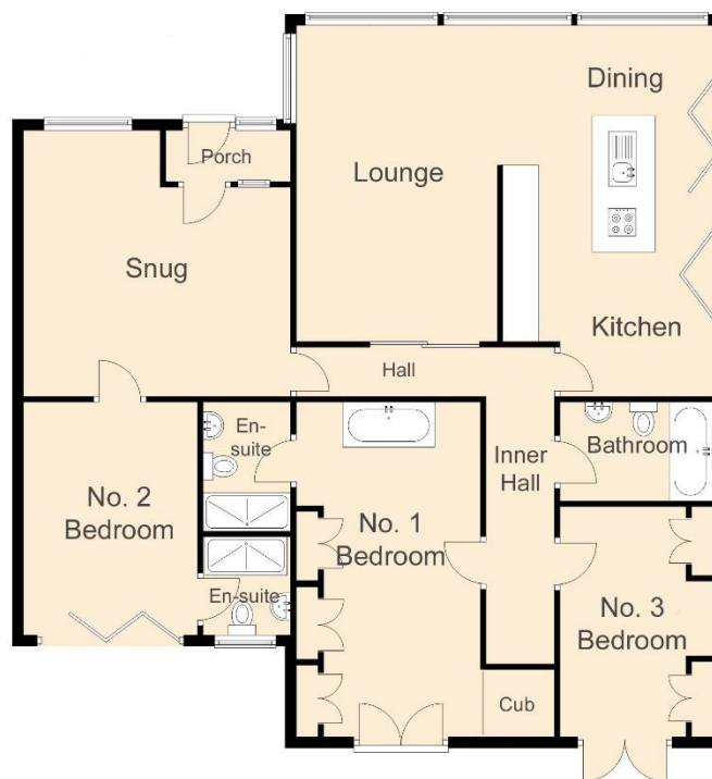
Ground Floor Approx. 165.6 sq meters (1782.6 sqft)